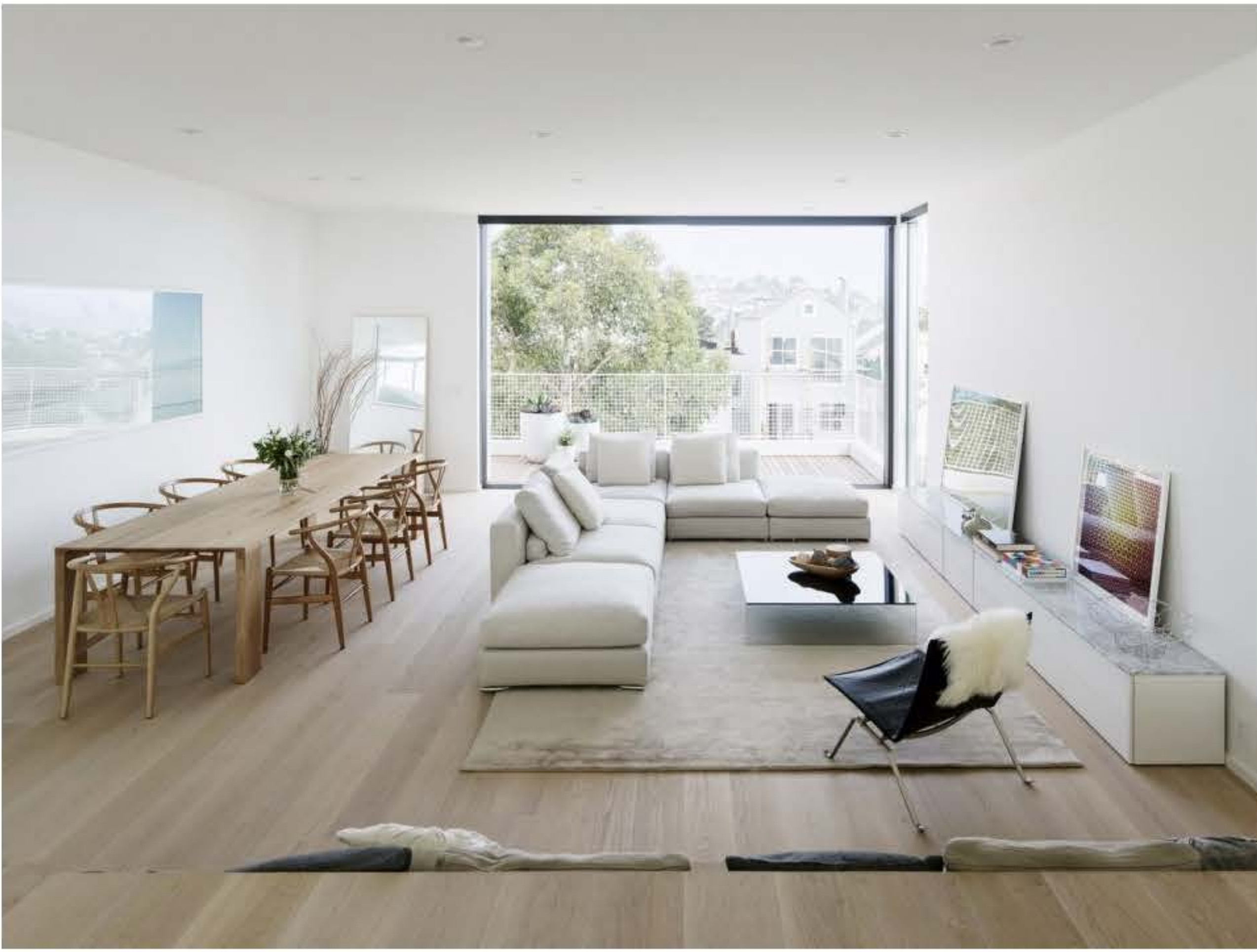
▼厨房与客厅相连，kitchen on the upper level connects to the living room