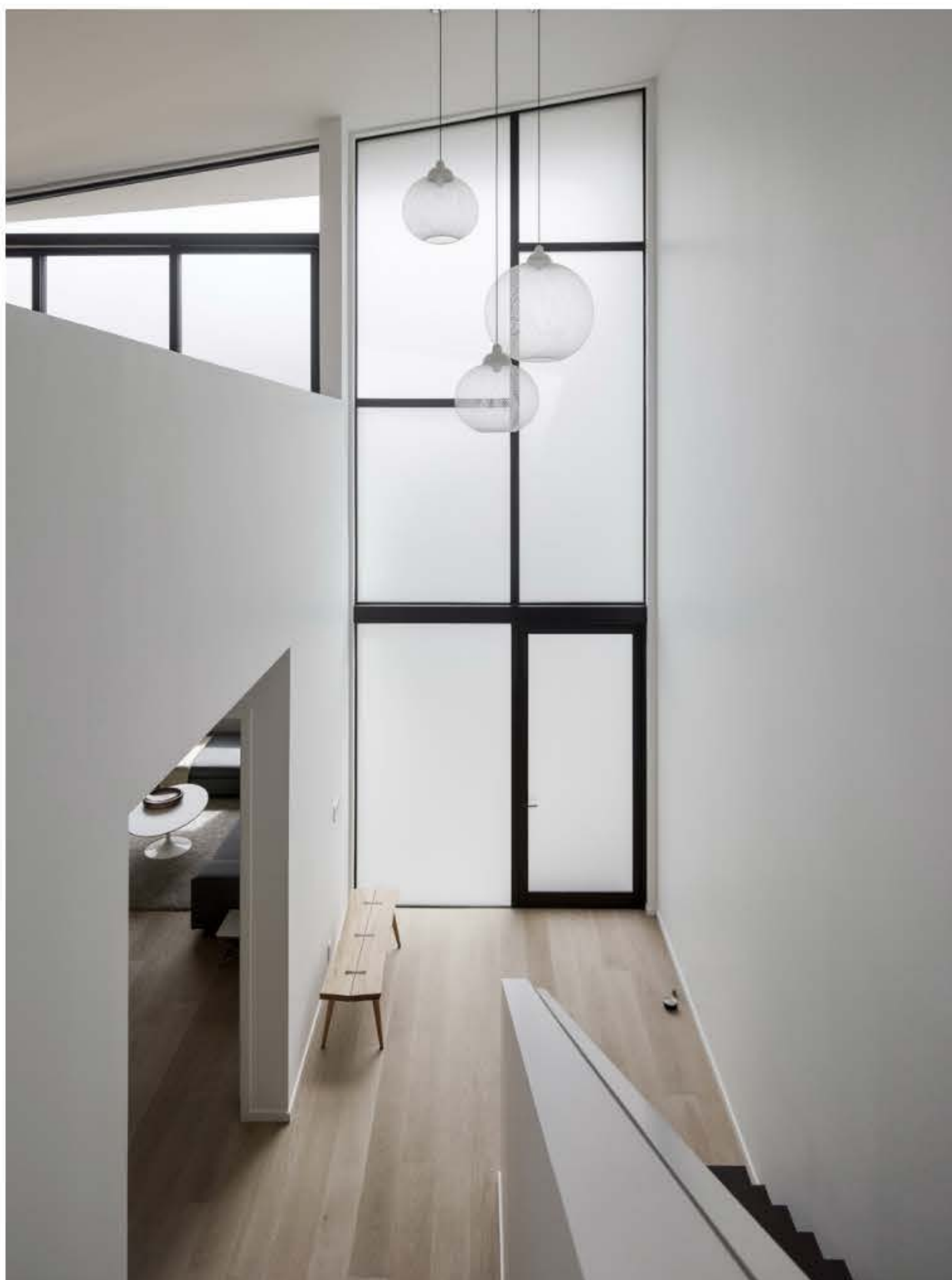
▼明亮的空间氛围，the bright interior